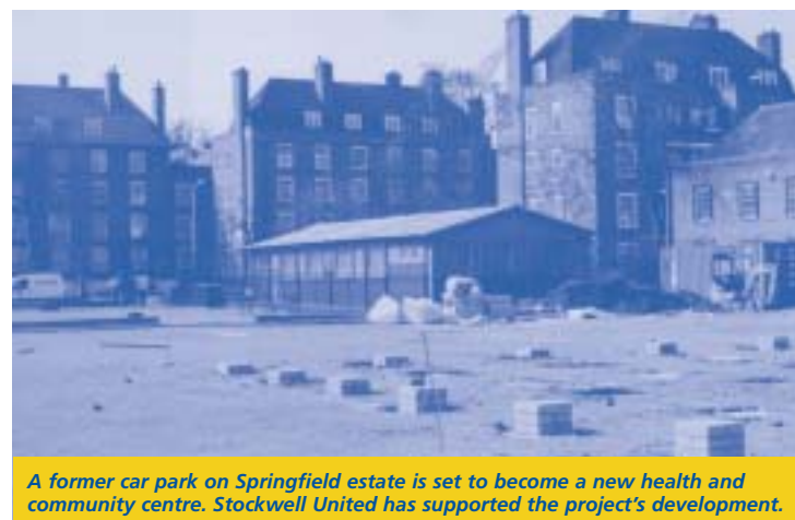
A former car park on Springfield estate is set to become a new health and community centre. Stockwell United has supported the project's development.