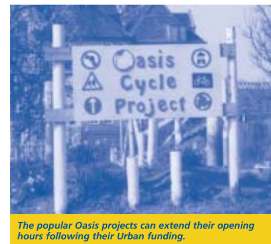
The popular Oasis projects can extend their opening hours following their Urban funding.