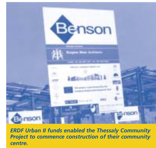
ERDF Urban II funds enabled the Thessaly Community Project to commence construction of their community centre.