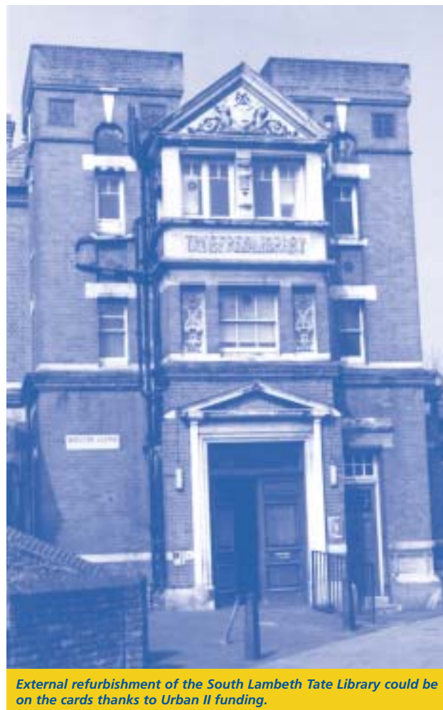
External refurbishment of the South Lambeth Tate Library could be on the cards thanks to Urban II funding.