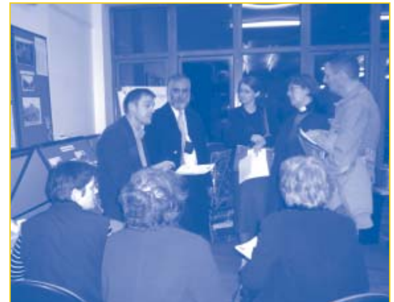
There was more than enough lovely grub for everybody.